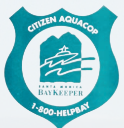
The 2003 badge.

For the better part of two decades, Santa Monica Baykeeper and our volunteers have earned a reputation as the "citizen aquacop," monitoring storm drains and outfalls and drawing the line to the source — so our advocacy team can draw a line in the sand.